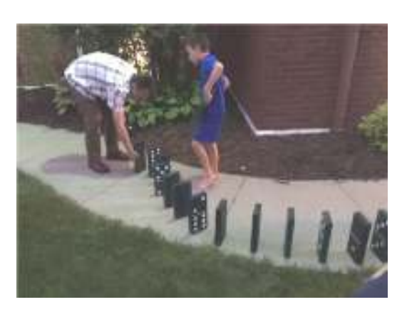
Treasure Seekers yard games and bell practice